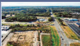
New retail development pad site near Mass Pike