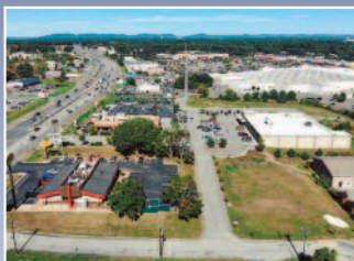
High volume retail pad site

In today's economy, the most successful organizations welcome the value of partnering. At Macmillan Group, our goal is to remain at your service – well after the papers are signed – to facilitate connections that strengthen and support your core business. Whether through additional real estate assistance, business or community introductions, or referrals to third-party services, Macmillan is available and committed to your continuing success.