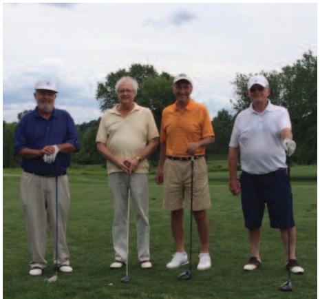
Annual Golf Outing

2 foursomes, 2 Tee/green signs, Table top display space at registration for company promotional materials, Company banner prominently displayed at registration, reception and dinner, Introduce tournament