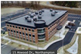
15 Atwood Dr., Northampton

50+ years experience in Commercial Real Estate Development, Brokerage and Property Management with a portfolio of over 2,000,00 sf of property from North Haven, CT to Greenfield, MA