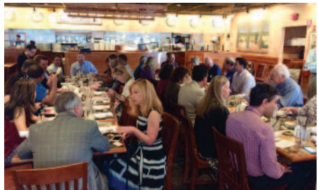
Chamber Networking Event