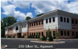
200 Silver St., Agawam