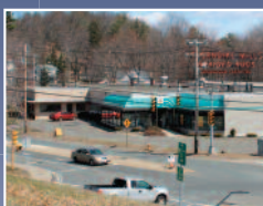
40,000 sq. ft. of light industrial/ distribution space on Mass Pike