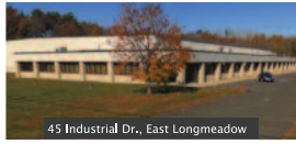
45 Industrial Dr., East Longmeadow