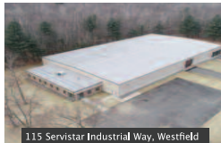
115 Servistar Industrial Way, Westfield