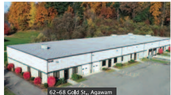
62-68 Gold St., Agawam