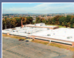
145,000 sq. ft. of light industrial/distribution space